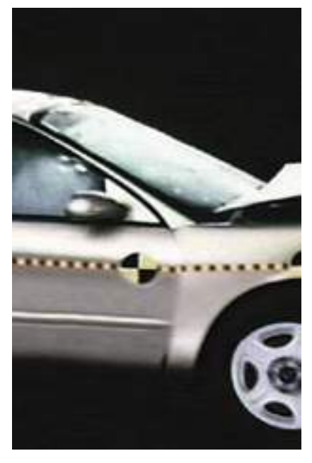
Crash test: April 2002

Note: If vehicle manufacturers have not published specific make and model drive away times, use this chart as a guideline.